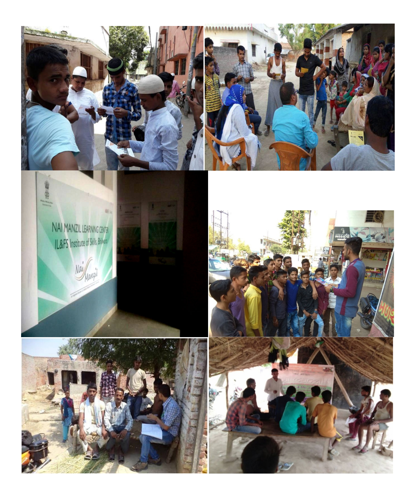
Awareness and beneficiary mobilization activities undertaken during the Nai Manzil Scheme implementation