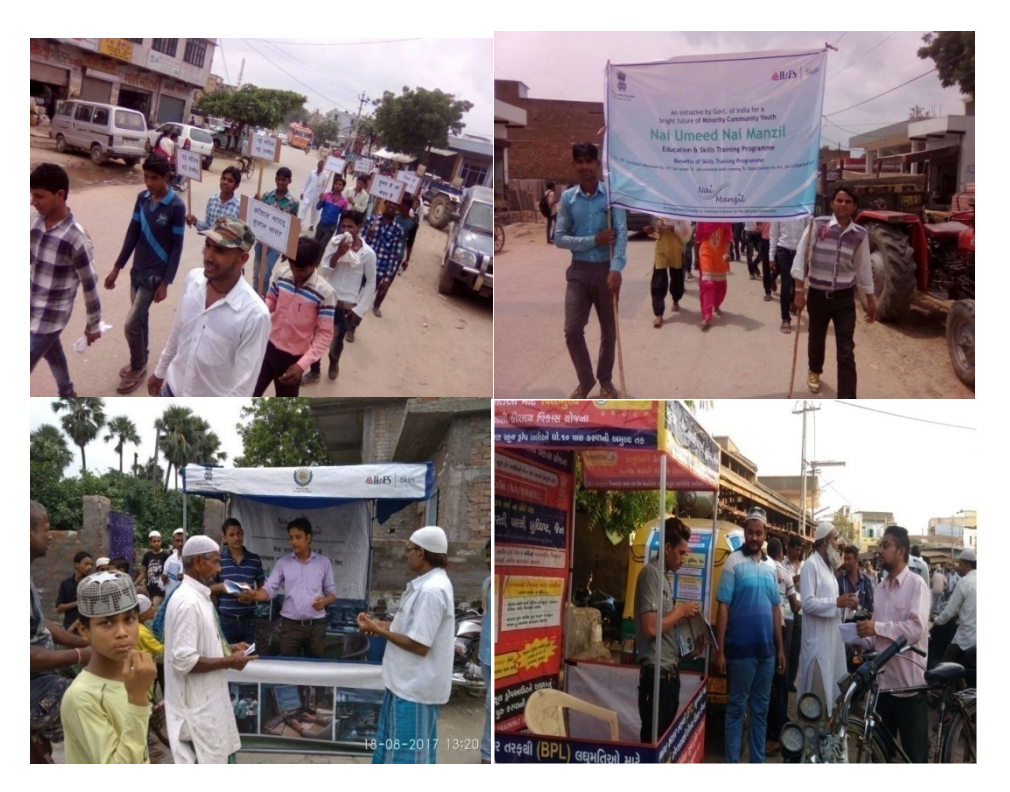
Awareness rally information kiosk installed during mobilisation of beneficiaries under Nai Manzil Scheme

and events where the crowd is already visiting. Personnel organizing and managing the camp should have required skills and knowledge and should be organized in a professional manner. Appropriate IEC material for the camp and IEC for camp should also be undertaken. Necessary permissions from the authorities should be taken before organizing the camp and attractive and informative banners/ boards should be developed for the purpose.